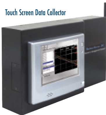
Touch Screen Data Collector

When failure is NOT an option, the Battery Advisor needs to be part of the plan